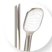
Brushed Nickel Q2HSKCSRBN