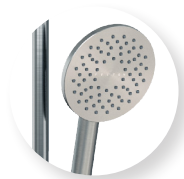
Brushed Gunmetal THDRGM