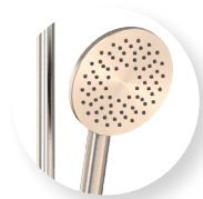
Brushed Nickel THDRBN