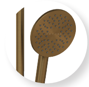
Brushed Bronze THDRBBZ