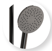
Black/Gloss Black THDRMB-GB